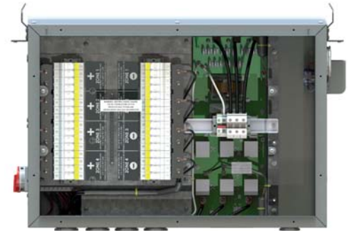
Standard Wiring Box