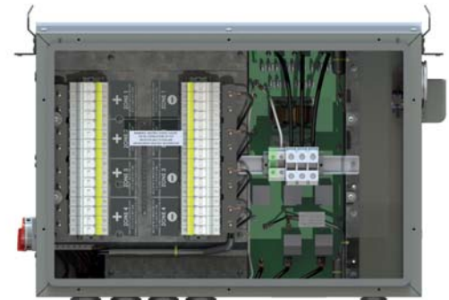
Large AC Terminal Wiring Box