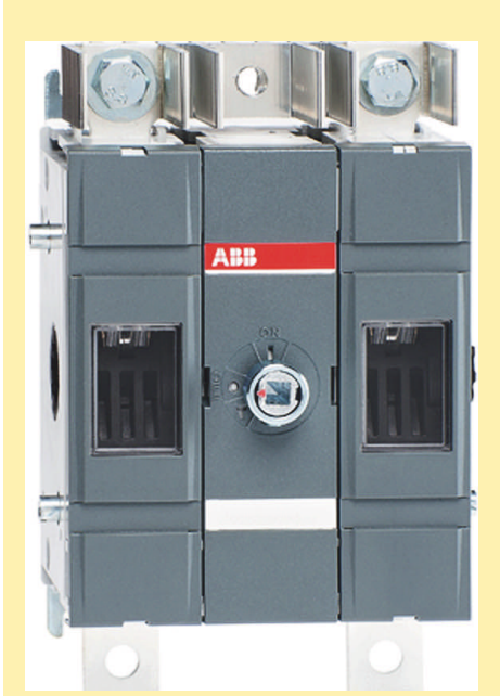
ODTC200US11 - solar switch.