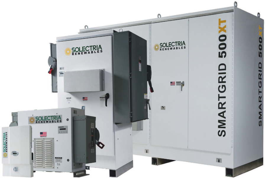
Solectria family of Inverters for all market sizes.

centrally managed at the inverter," Gun explains.