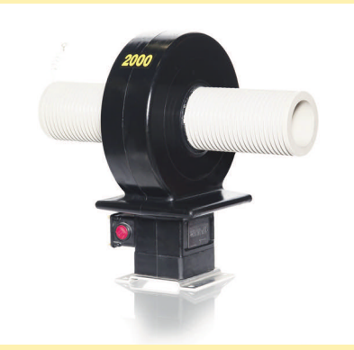
The ABB LG(X) current transformer is a popular choice for North American wind farm developers. This unit features high accuracy.

an algorithm that states what a panel should be doing. We are measuring every panel every two seconds. Smart modules can be installed twice as close to shade sources as traditional modules."