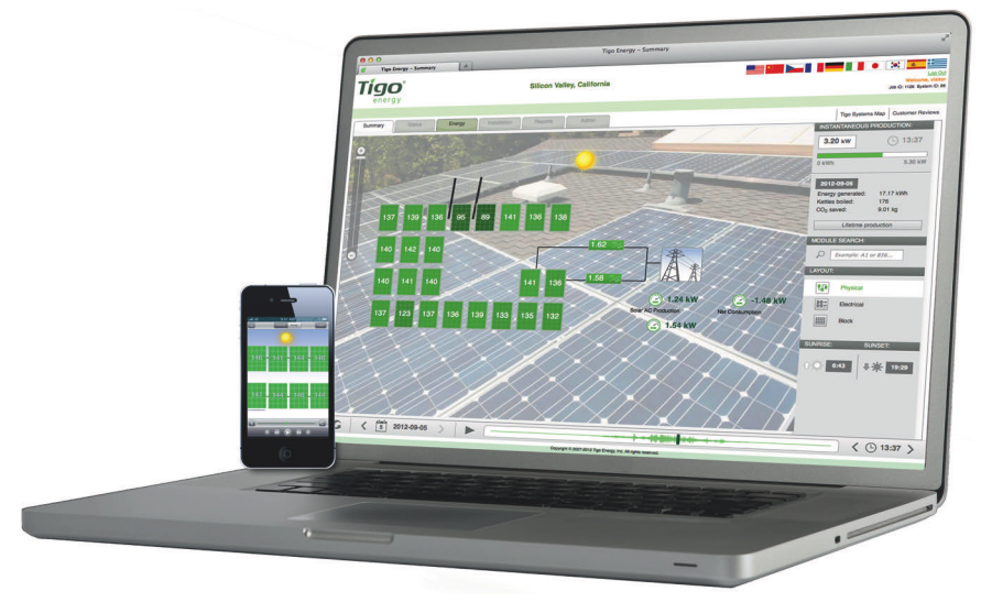
Tigo optimisation technology measures every panel every two seconds.

"A solar farm is set up in a very similar manner. There is often a Red Lion switch on each solar panel itself that will tie back to a central monitoring