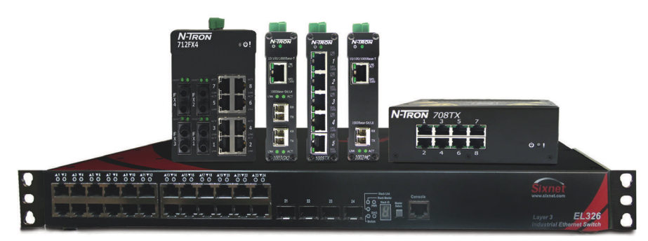
Red Lion technology allows wind and solar to transmit data swiftly and securely over long distances.

The LTi REEnergy PVmaster with Ampt Mode<sup>™</sup> is in a new class of lowest cost, highest performing large-scale solar inverters. This HDPV-compliant inverter's output power rating is increased 60% when deployed Ampt DC/DC converters to lower costs by 40% while operating at greater than 98.6% CEC efficiency.